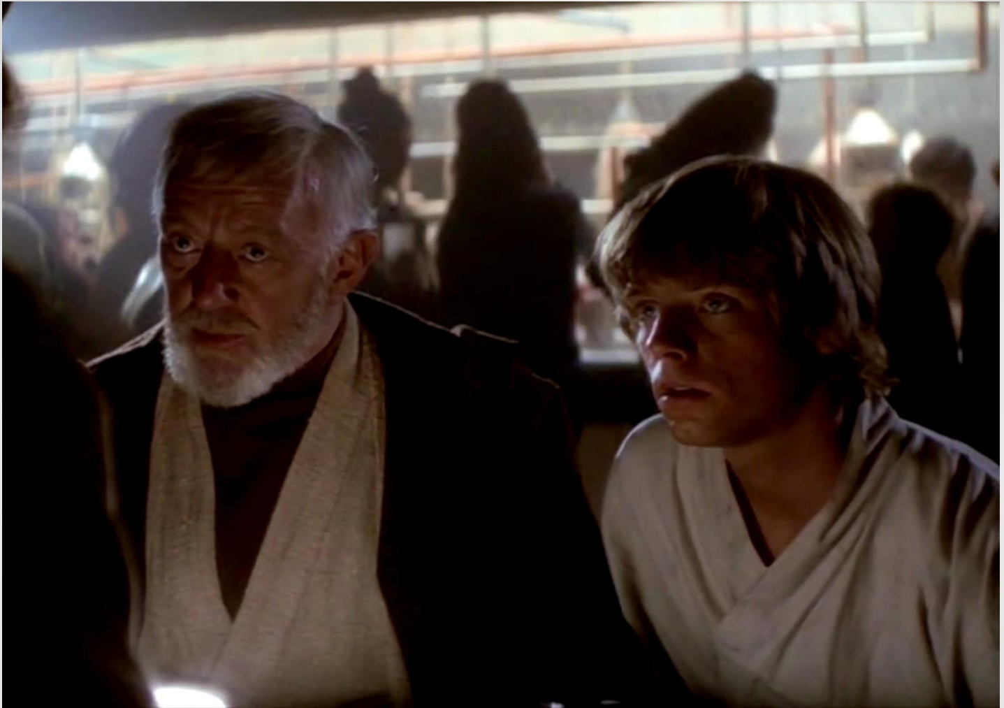
Star Wars: Luke & Obi-Wan